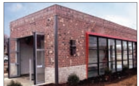
Thin Brick versions of St. Windsor and Nob Hill on a commercial car wash show all the warmth, beauty and richness of full-size brick, yet deliver savings on installation time and costs.

Bigler Plant makes Thin Brick in modular (1/2 x 2-1/4 x 7-5/8) and engineer (1/2 x 2-3/4 x 7-5/8) sizes. The plant has inventory on all four products. Type "S" samples are now in production.