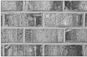
The tumbled-look texture of the Garden Series is now available in Thin Brick from Bigler Plant.

Among residential and commercial builders, not to mention the growing market of do-it-yourselfers, Thin Brick is enjoying an outright success. In response to demand Bigler Plant has introduced Thin Brick versions of four popular products: Arbor Rose , St. Augustine and St. Windsor from the Garden Series line of tumbled-look brick, plus the softly sculpted and shimmery Silverbrook . All are fired brick made with the same raw materials and to the same exacting standards, including color and texture, as their full-sized counterparts and all impart the same unrivaled classic look and richness of genuine brick—but at 1/6 the weight!