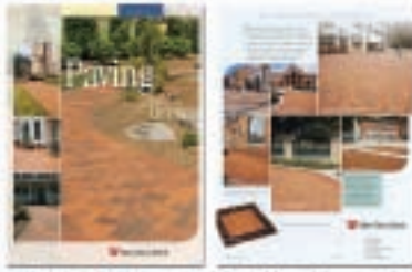
Single sheet Residential (front)