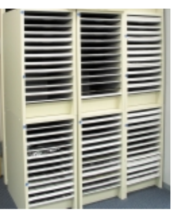
Stackable Type "S" Inventory Cabinets.

All three merchandising units are available now. To place an order, contact your District Sales Manager or regional Sales Office and request the "Glen-Gery Point-of-Purchase Order Form." When ordering the Large Distributor Showroom Display, also ask for the "Project Image Order Form" that allows you to