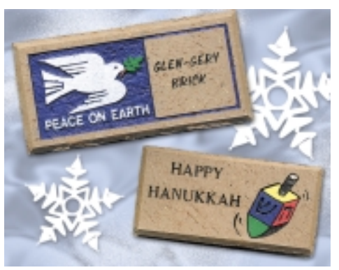
Place your orders now for 2005 Holiday Brick.

Bring the spirit of the season into your home or office with our 2005 Holiday Brick. "Peace on Earth," featuring an olive branch-bearing white dove in relief against a royal blue